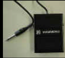
Expression Pedal EXP-100F